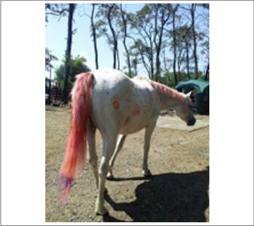
Figure 1. Playing after finger painting.